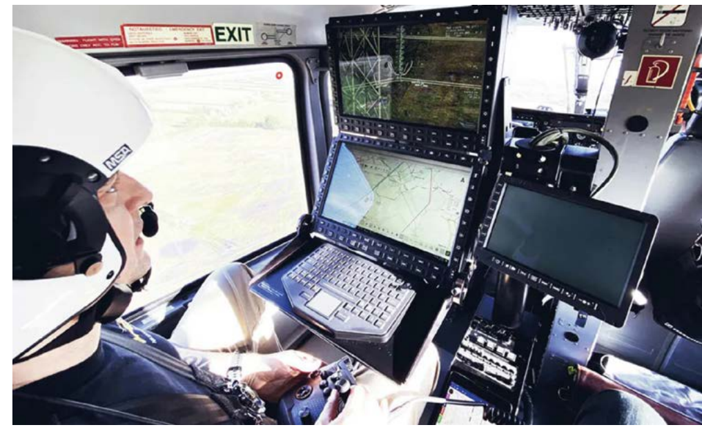
All set: a typical operator workstation for an aerial thermography installation. Advanced onboard processing speeds up fault location and identification tasks.

"Just in this past year we've announced an onboard solution that makes it dramatically easier and more efficient for anyone to operate the system, not just an expert with a master's degree or a PhD," he says.