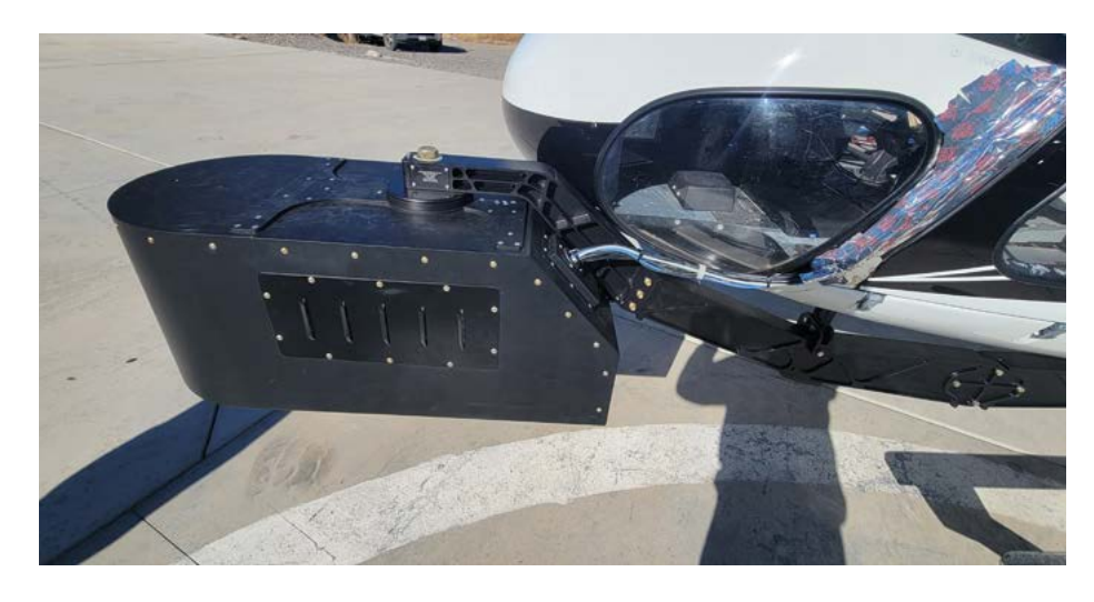
Payload: the Galaxy T2000 LiDaR and camera solution delivers ultra high resolution 3D measurements on electric infrastructure, as well as nadir and oblique imagery. The data is used for as-built infrastructure mapping, together with close-up inspection of assets.

radiance measurements, broadening their range of applications.